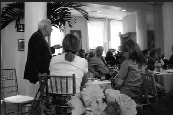
The audience responds to the new president's questions