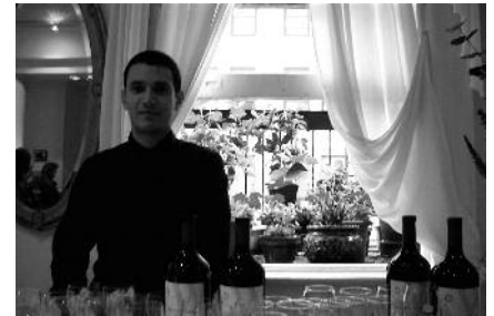
One of the genial Party Loft staff

NAAP looks forward to hosting more of these meetings as the appreciation expressed by attendees through e-mails and phone calls was so enthusiastic.