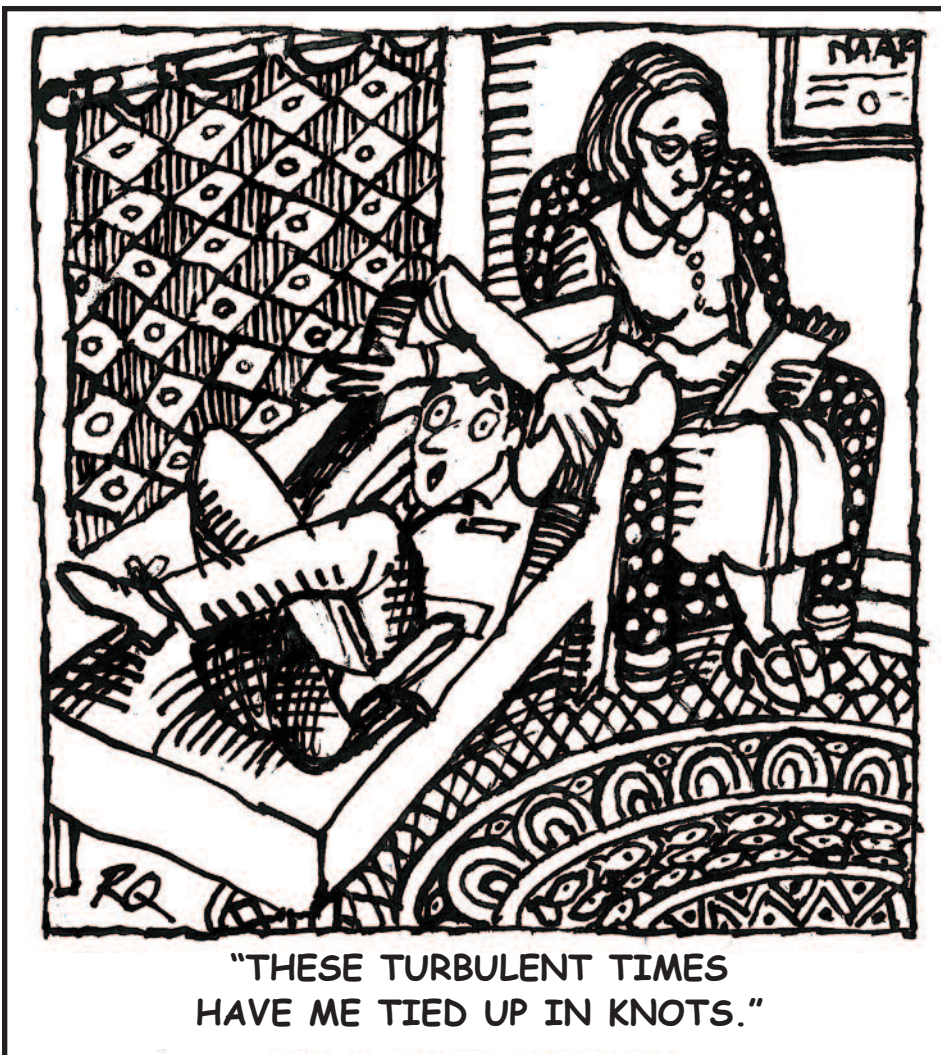
"THESE TURBULENT TIMES HAVE ME TIED UP IN KNOTS."

The theme of Psychoanalysis and Culture will be woven through WSI's Annual Conference scheduled for April 18, 2010. We look forward to announcing an exceptional roster of speakers for this event. See the winter edition of NAAP News for further details.