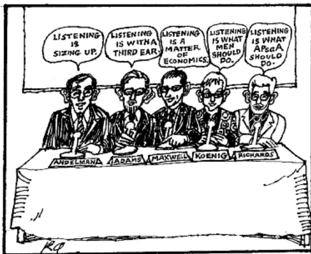
THE PANELISTS SPEAK

We can be sure of hearing more in the future about the extent to which our vulnerable, individual patients are, in a sense, the “designated patients” of traumatic cultural events and processes. This will require that psychoanalysts bring their training and experience to bear on efforts to modify these cultural processes, in order to bring about a healthier cultural environment.